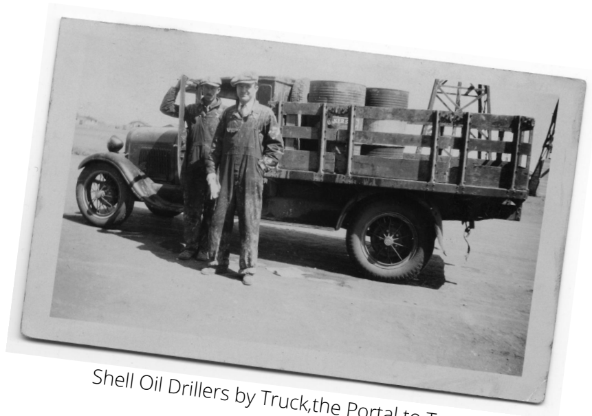
Shell Oil Drillers by Truck