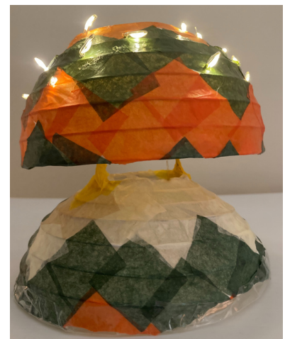
The W.H. Stark House - 2021